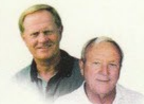
Jack Nicklaus & Arnold Palmer