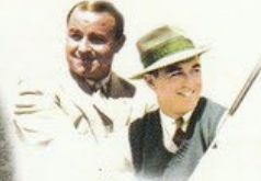
Gene Sarazen & Sam Snead