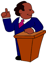
The Monthly Word